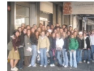
School/student groups regularly visit Ground Zero Museum Workshop

Unsalaries, Official Ground Zero Photographer Gary Marlon Suson spent many months 'living' at the WTC site. The resulting collection, dubbed "Incredible" by Fox News Channel and "Extraordinary" by the NY Daily News, is sure to leave you feeling more connected to what happened on that fateful day in September, 2001.