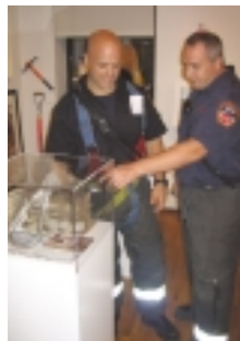
NYC Firefighters view artifacts recovered from the WTC site.

Ground Zero Museum Workshop is NYC's Newest & Most Moving Museum. Located just 8-minutes by taxi or subway ("E" Train) from Ground Zero, it features the well-known images of Gary Marlon Suson, an Honorary FDNY Battalion Chief & the Official Photographer at Ground Zero for the Uniformed Firefighters Association. 100 incredible stories of select images & artifacts are programmed into audio units that tell the personal stories of the "Recovery Period" at Ground Zero, accompanied by