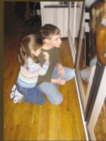
The museum is non-graphic and suitable for children of all ages